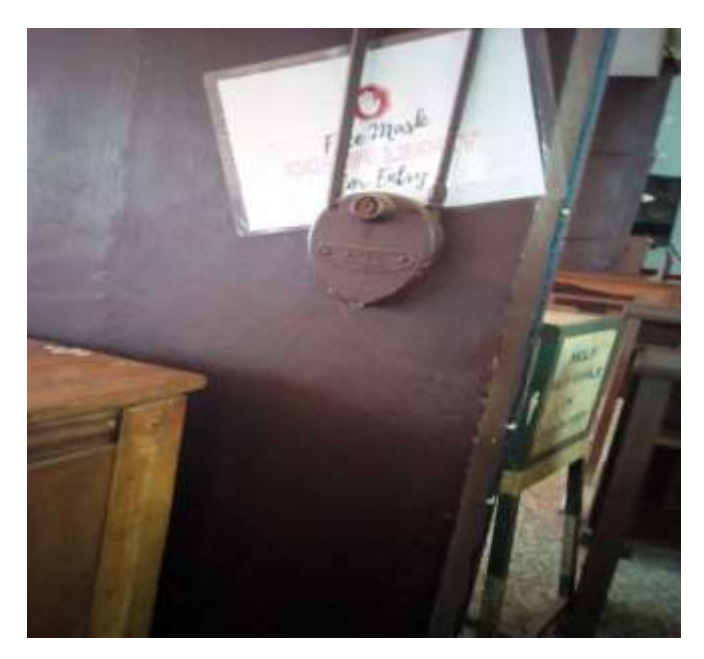
Figure 2: A warning at St Peters Chaplaincy University of Nigeria, Nsukka showing that wearing a face mask is mandatory for entrance into the chaplaincy.