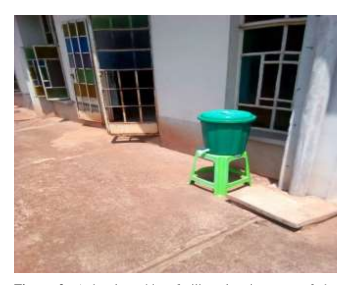
Figure 3: A hand washing facility placed at one of the entrances to St Peters Chaplaincy, University of Nigeria, Nsukka.